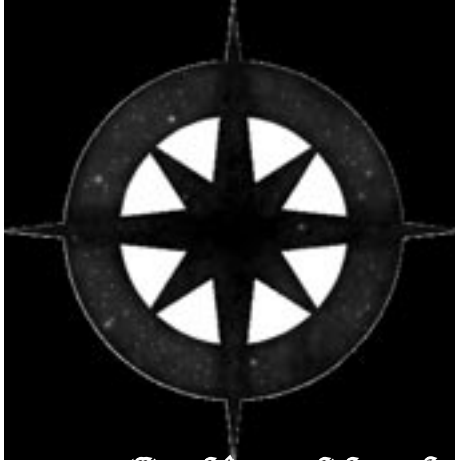
All in Good Time -- Graphic by Russ Hooper

A celestial galleon, captained by Giovanni da Verrazzano, glided around Europa. Far below the ship, through the void of space, into the thin atmosphere, nestled on the streaked ice, the only moving thing was the temporal reactor, dutifully drawing on the energy of time to power the colony. The power wasn't needed, though. Europa One's inhabitants were immortalized, frozen in time on a frozen world.